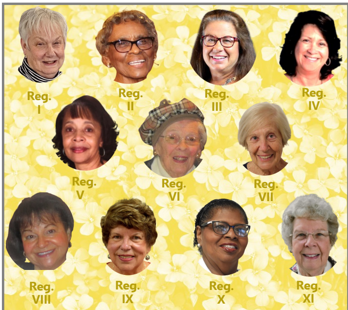
Golden Key Award Recipients