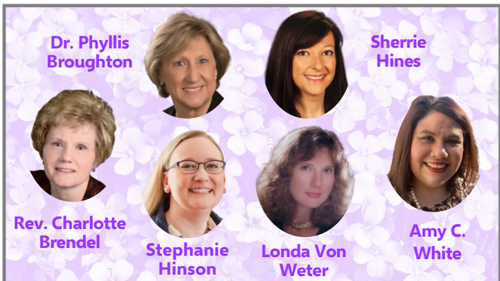
Rising Star Award Recipients