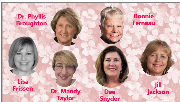
Presidential Chapter Award Recipients