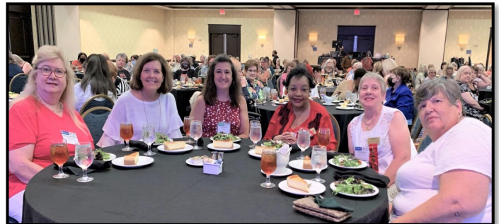
NC DKG leaders attend Leadership Conference in Atlanta.