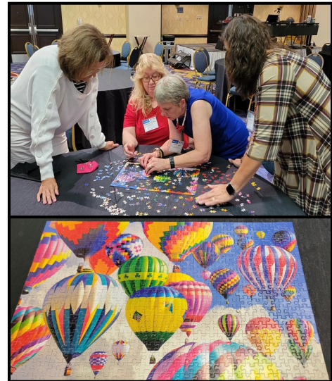
NC DKG leaders worked as a TEAM to complete their puzzle . . . the only team to finish the task.

Regardless of your position in DKG, you are part of at least one TEAM. Working together will result in success for your chapter, state, and international organization.