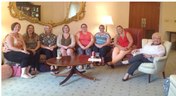
DKG Next in Austin, TX

Please consider attending the International Convention in Nashville in July 2016. DKG Next will be presenting two breakout sessions: Creating a Positive Community in your Chapter and Marketing your Chapter to the Community. We will also present mini-sessions on Technology. I look forward to seeing you in Nashville!