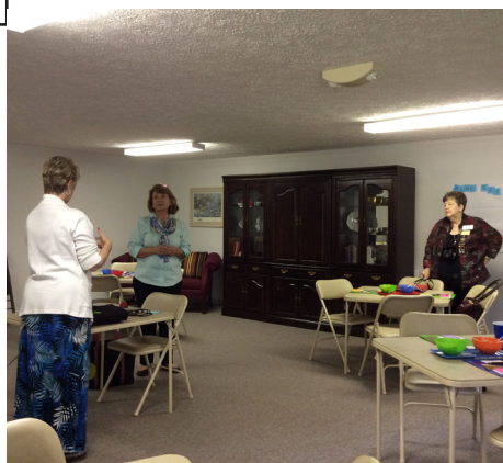
Scenes from 2015-2017 Orientation