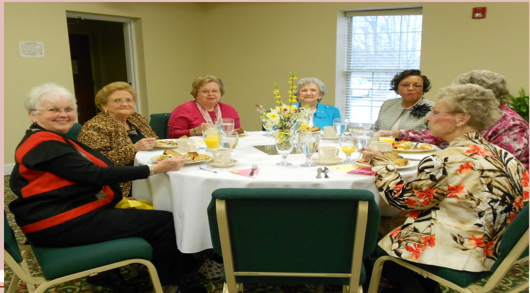
Smiling faces await for the Fashion Show to begin..