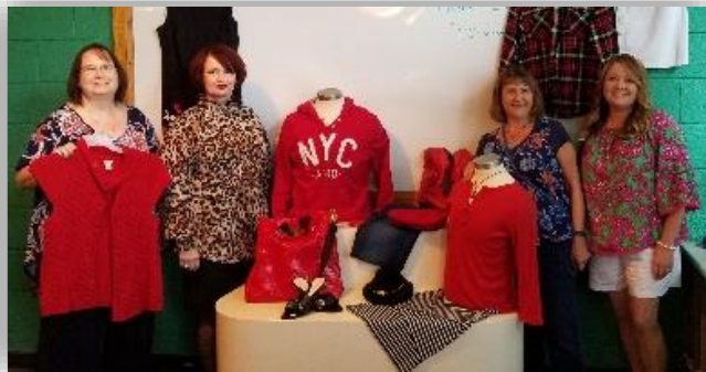
DKG Sisters setting up displays

Members of Delta Sigma gathered at the Asbury Resource Center (ARC) on Thursday, August 2nd to assist with sorting and organizing donations in preparation for a Back to School Shopping Day at the ARC. After a brief orientation to the ARC and the processes used by the volunteer staff to organize and maintain the Center, Delta Sigma members quickly went to work sorting and organizing recent donations. Several of our Delta Sigma fashionistas used their talents to construct displays in each of the rooms at the Center, creating an atmosphere of shopping boutiques.