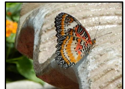
Fountain's Edge by Elaine Boysworth