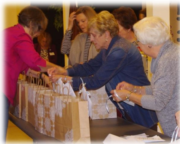
Preparing Gifts for Beginning Teachers