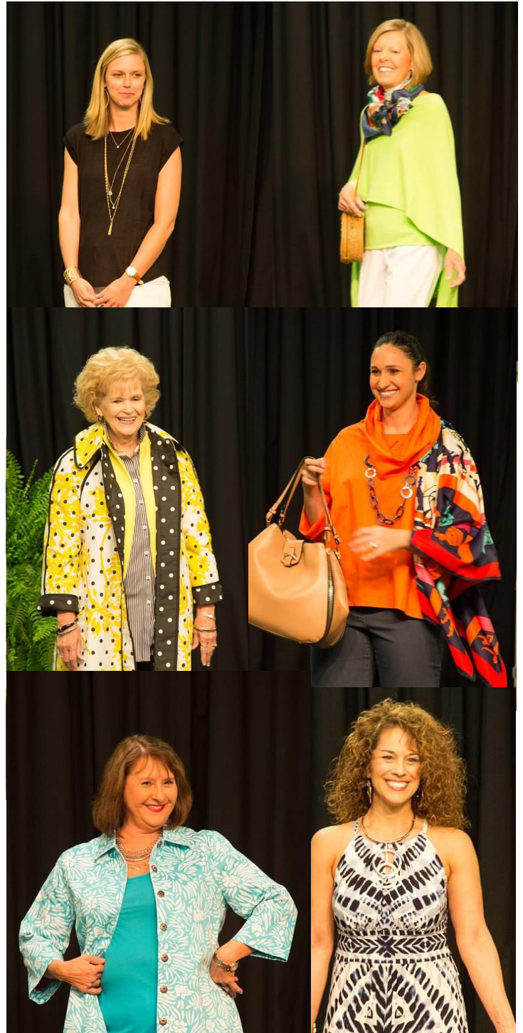
at the 2016 Fashion Show.

Fashion show plans will be discussed in greater detail at our regular meeting on February 23rd. Let's make the Seventh Annual Delta Sigma Fashion Show the best ever!