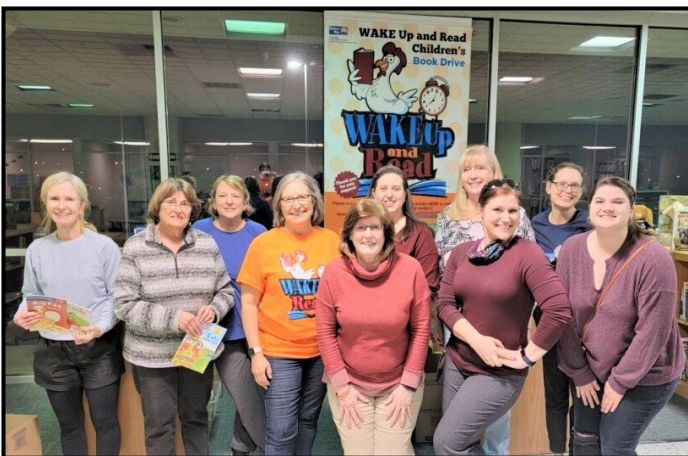
Alpha Omicron volunteers at WAKE Up and Read

Alpha Omicron (Region III, Wake) members recently volunteered at WAKE Up and Read, learning about the many ways this coalition supports reading in schools and the community. Members worked on sorting and packing boxes of books and preparing them for distribution.