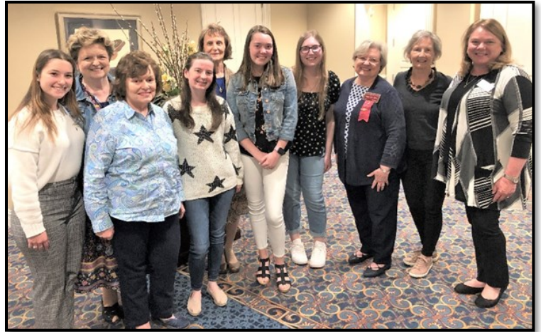
Chi mentors with their mentees*